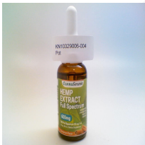
glass dropper bottle